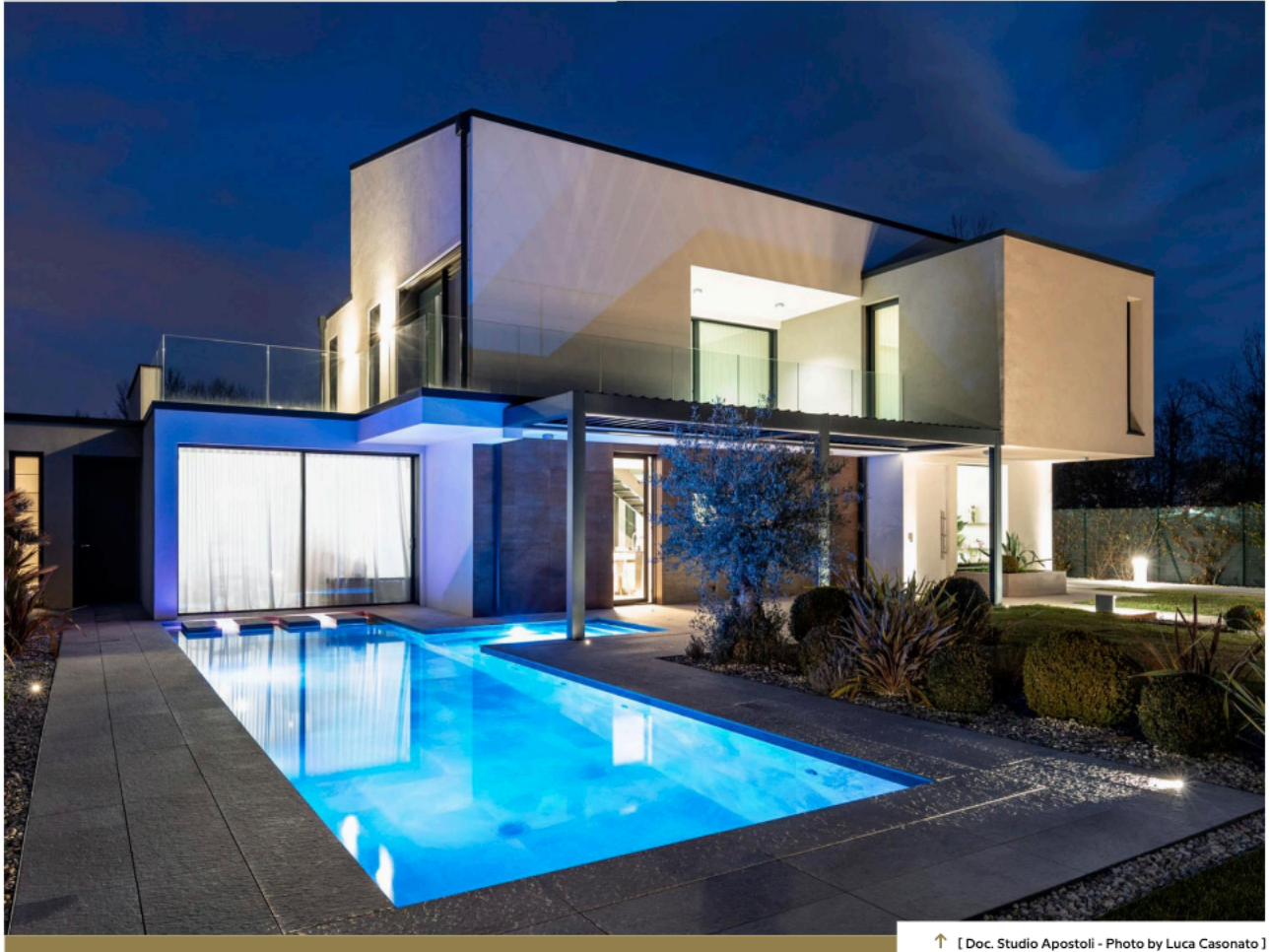
↑ [ Doc. Studio Apostoli - Photo by Luca Casonato ]

« The Italian pool Industry is moving towards soft geometries, smooth lines, and a strong presence of sand, wood, or vegetation »