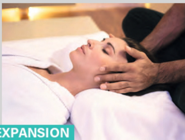
CLINIQUE LA PRAIRIE