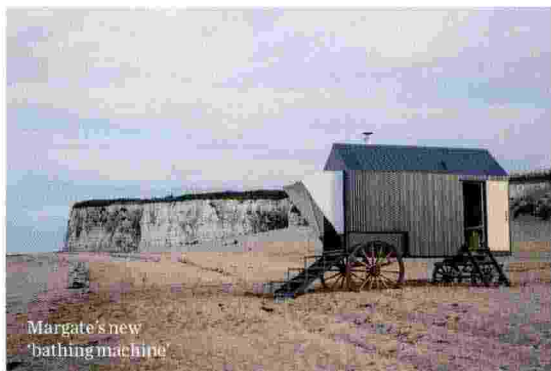
Margate's new 'bathing machine'

It's a reminder that wellbeing and environment are inextricably linked, and that low impact architecture is only one factor – what makes a space restorative is far harder to define.