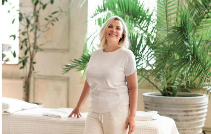
AAG wants to conduct the surveys outside of the US by 2024